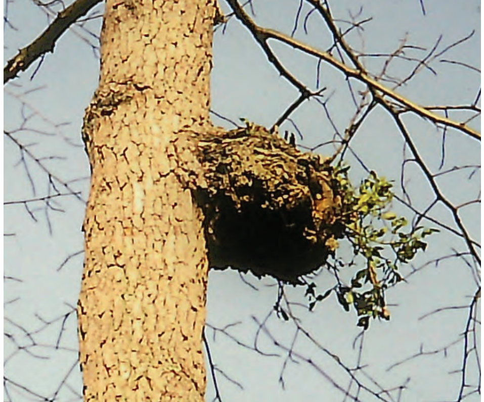
Mistletoe growing on a tree in Snowden Woods and showing the gall created by the parasite, March 1992.