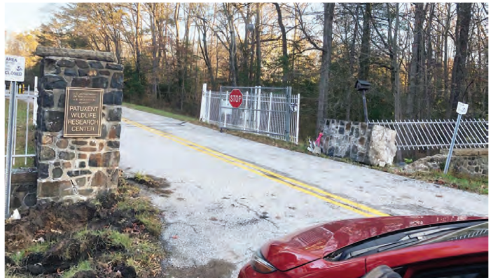
Main gate scene after crash of box truck hitting and toppling concrete/stone column, Nov 13, 2020.

This intersection has been a safety problem for years. Most accidents in the past, I believe, are from cars coming toward the main gate on Powder Mill Road before we had a stop light. Drivers apparently do not realize the road ends at Rt # 197. Several staff of PWRC