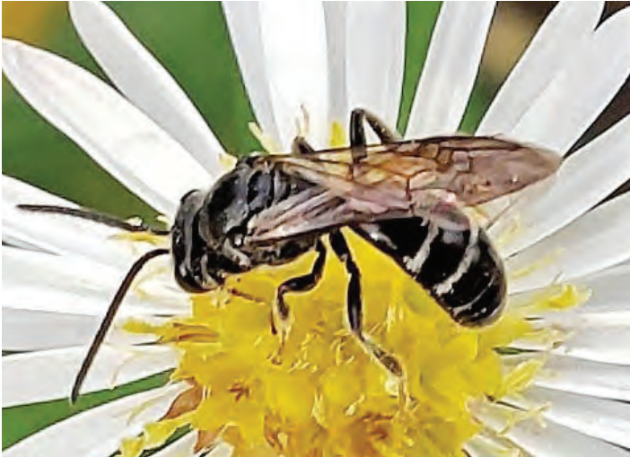
Dark-winged Sweat Bee (North Tract)