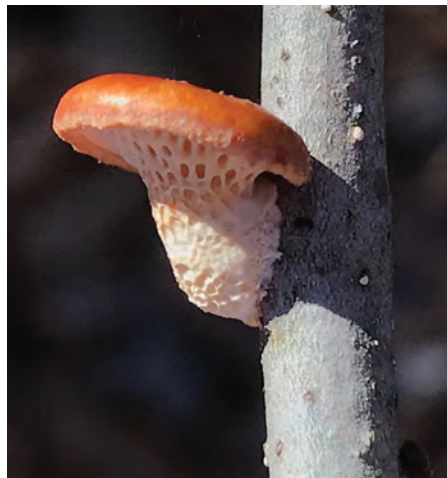
Hexagonal-pored polypore (Neofavolus alveolaris)

I made decisions based on the information I had accumulated. I then posted photos and notes on iNaturalist of the 15 species I collected on our walk. People confirmed my IDs for three species and I modified the original identification of the fourth species. Here are the four IDs from my North Tract walk that I feel confident about.