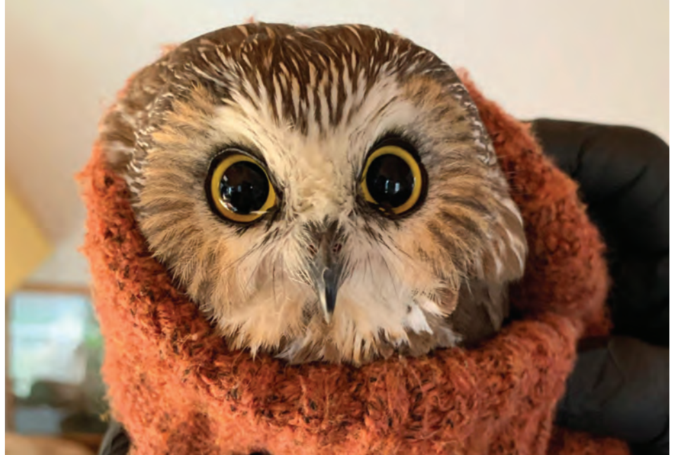
Saw-whet owl captured at Rockefeller Center in a Norway spruce tree.

The story of Rockefeller revived some memories among retired Patuxent staff about another owl-in-the-tree miracle that occurred in December 1979. At that time there was an an-