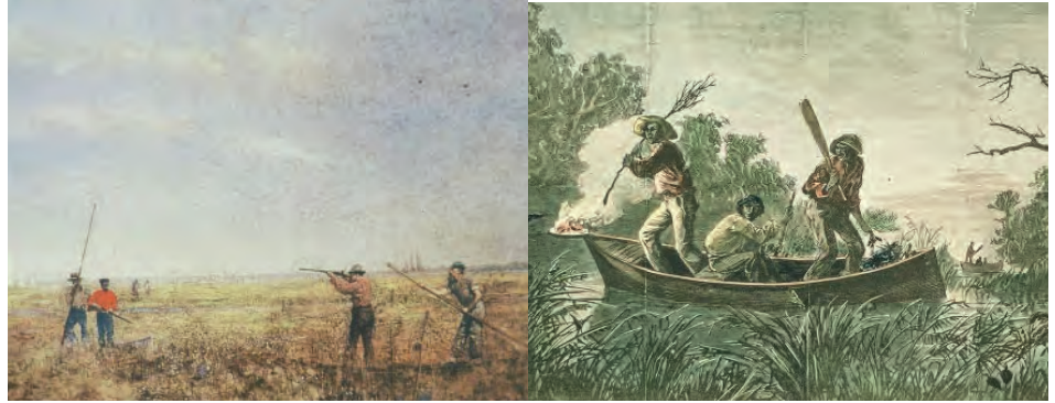
Sora rails were attracted to the light of a burning fire on the bow of a skiff.