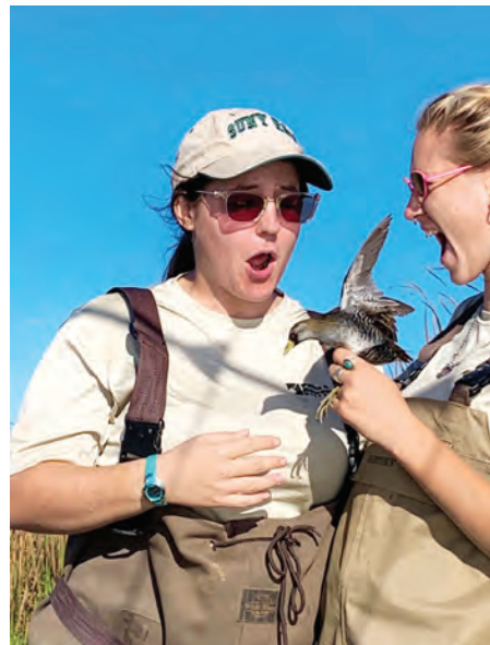
Exciting adult sora catch.