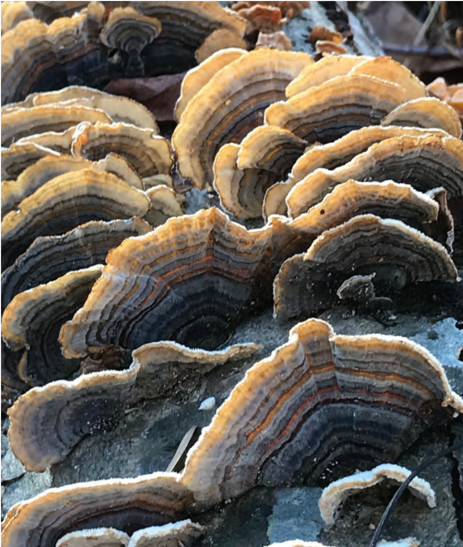
Turkey Tail ( Trametes versicolor )