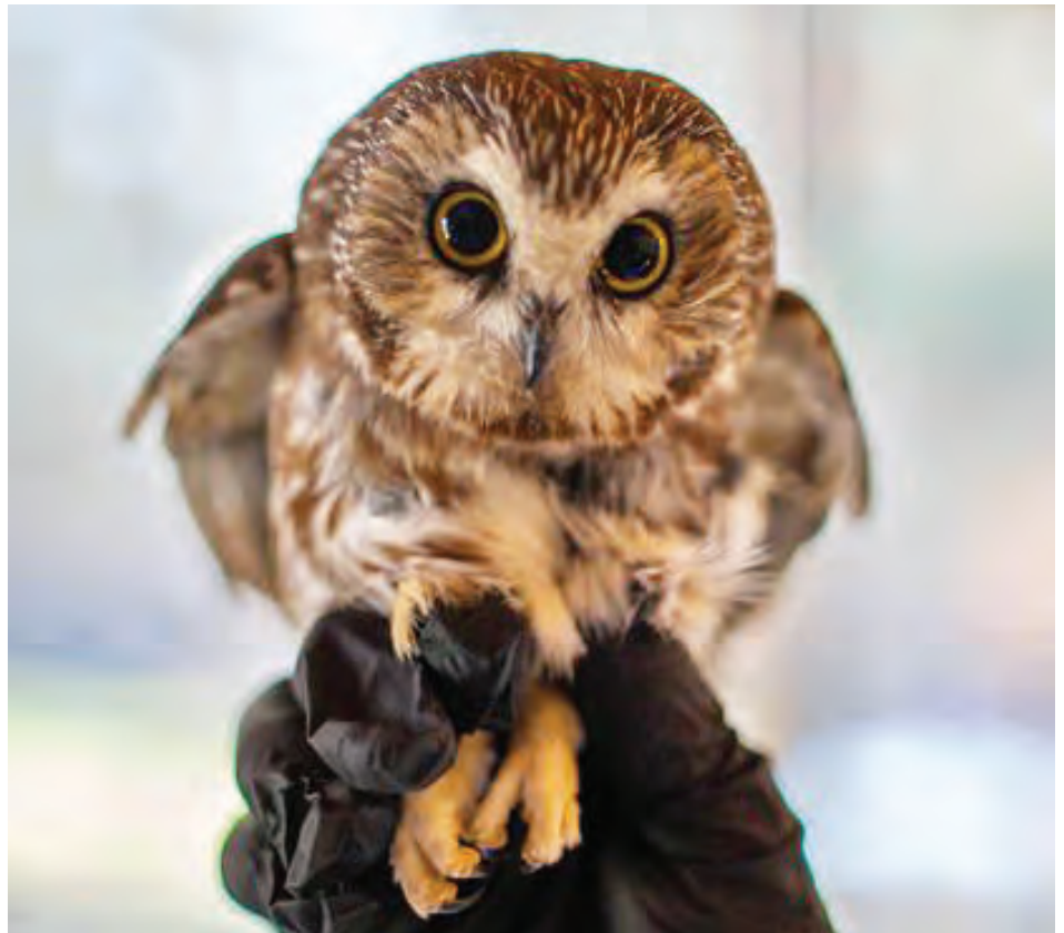
Rockefeller (Rocky) at the Ravensbeard Wildlife Center.