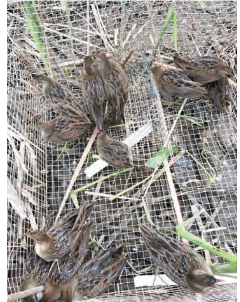
Juvenile soras in marsh trap just prior to banding and release, Sept 1, 2017.