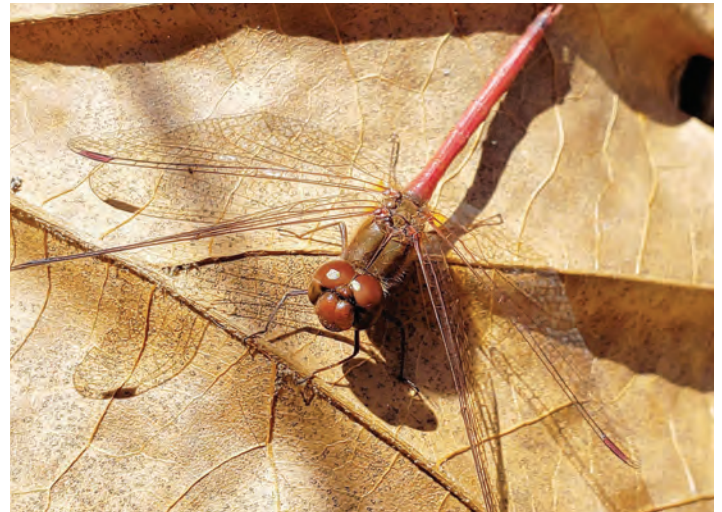
Autumn Meadowhawk (North Tract)