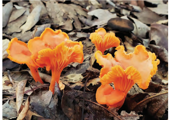
Red Chanterelle Mushrooms (South Tract)