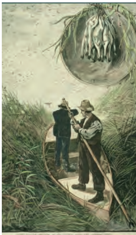
19th century lithograph of rail hunting.

Meanley, that he picked up on a visit to the park.