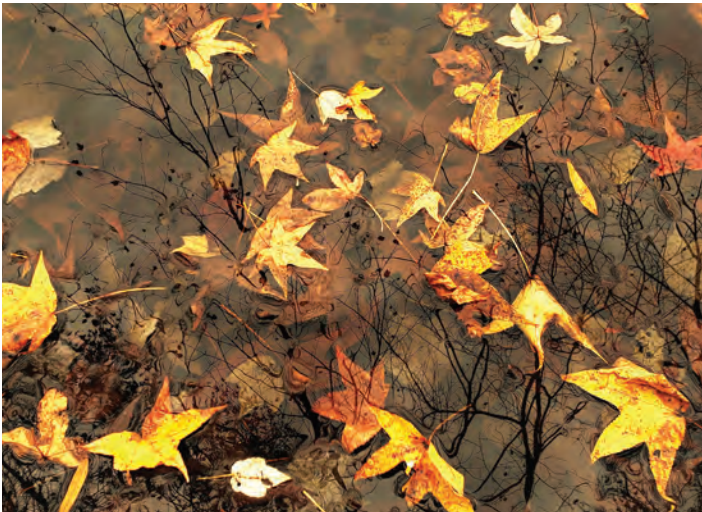
Sweet Gum Leaves (South Tract)