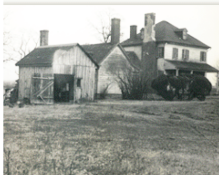
Goodwood, built about 1760, and renamed Gladswood in 1860

The old Post Road and Black Bridge across the Patuxent, a successor of an earlier crossing, were used constantly by us in the construction of fences and roads on the Anne Arun-