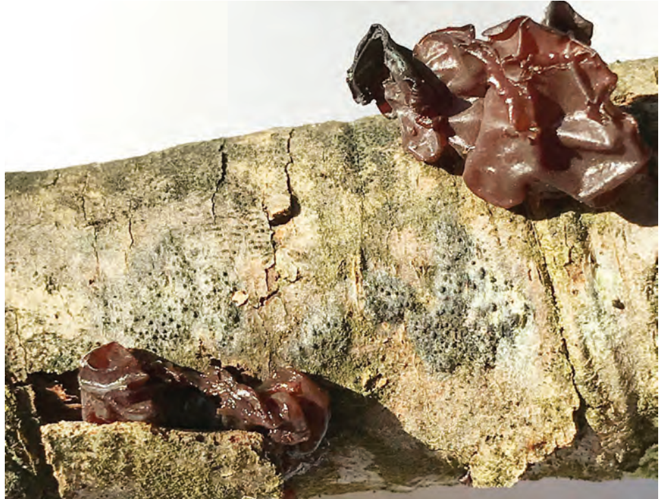
Black Witches Butter (Exideia glandulosa)

Identifying fungi is more difficult than identifying birds, butterflies, or plants. It's helpful to gather as much information as you can about the environment including the what kinds of trees are in the nearby area (dead wood like stumps and fallen branches can be especially challenging), what the fungi is growing on or in, what the microscopic spores look like (size, color, shape), and whether the fungi react to certain chemicals. High-quality close-up photos also help. There is no cheap and easy way to collect all this information. There is also no comprehensive guide for the tens of