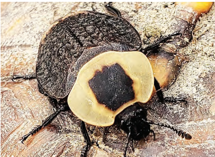
American Carrion Beetle (North Tract)