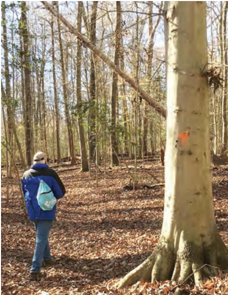
The orange arrow on the beech tree marks the Forest Trail.

Late fall is an excellent time for a walk in the woods. The woods may look drab with brown, not green, as the predominant color, but there's plenty to see. My husband and I walked on the Forest Trail at Patuxent Research Refuge's North Tract in mid-November looking for fungi. All the fungi we saw were saprobes; decomposers which perform the critical job of recycling nutrients from dead wood in a forest.