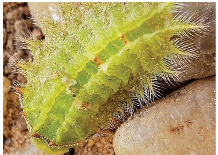
Crown-slug Moth (North Tract)