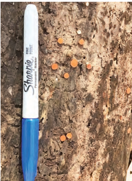
Eyelash Cup ( Scutellinia sp.)