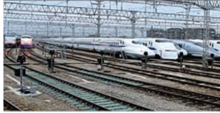
Maintenance yard for the Bullet Train in Japan.

Patuxent Research Refuge. New roads accessing the facility would be built across BARC lands west of Springfield Road.